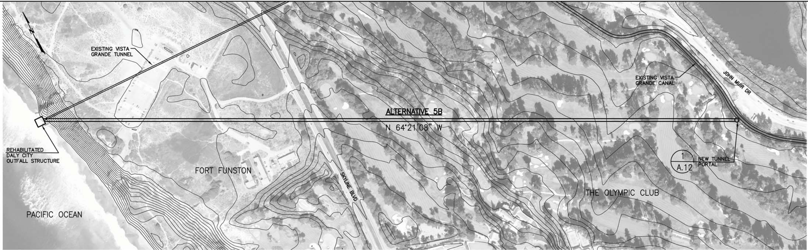
PLAN VIEW - SF DATUM