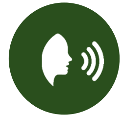
Education & Outreach