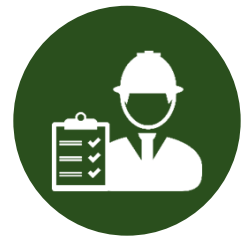
Jurisdiction Inspection & Enforcement