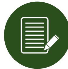
Recycled Paper Procurement