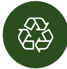
Recycled Organic Waste Procurement