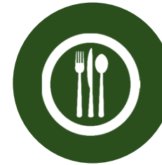
Commercial Edible Food Generators