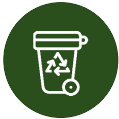
Organic Collection Services